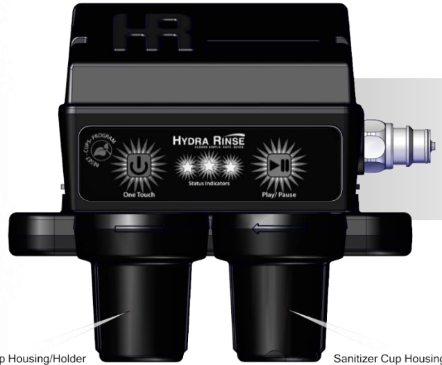
Cleaner Cup Housing/Holder