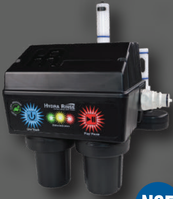
Hydra Rinse, LLC NSF/ANSI 6 - HRF2-0