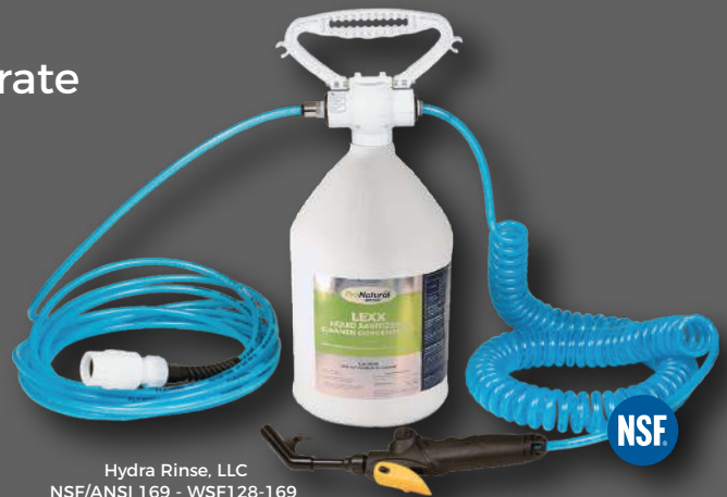
Hydra Rinse, LLC NSF/ANSI 169 - WSF128-169